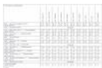
Crew Currency configuration

Leon can follow the crew currency for the pilots in your company. In Settings > Crew Currency you can set up the different types of currency your company follows. First mark the checkboxes next to the currencies you want to use to activate them (number of days is editable for each currency type) and then tick the positions for which the currency should be followed for particular aircraft types.