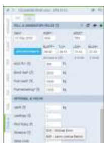
Number of landings and Pilot Flying in the Journey Log

Leon can follow the crew currency for the pilots in your company. In Settings > Crew Currency you can set up the different types of currency your company follows. First mark the checkboxes next to the currencies you want to use to activate them (number of days is editable for each currency type) and then tick the positions for which the currency should be followed for particular aircraft types.