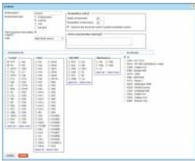
Endorsement definition setup

Leon can store the crew and staff documents such as licences, visas, medicals, trainings, etc. The general term we use for this whole area is “Endorsements”. Endorsements are assigned to function groups, ie. cockpit and cabin.