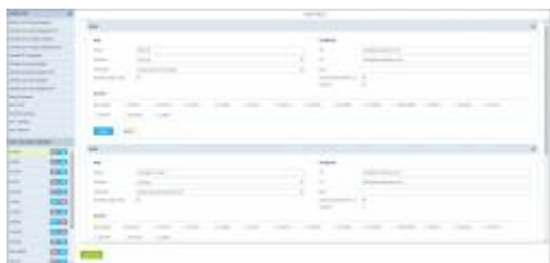
MVT messages rules configuration

The MVT configuration panel found in Settings > Email Templates > MVT Messages allows to set up a mechanism that will automatically send out movement messages via email when the Flight Watch of the flight is filled in (either manually or by Eurocontrol).