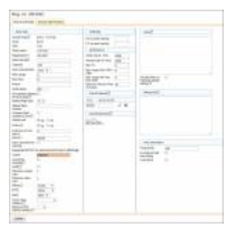
Aircraft data editing panel

To add a new aircraft, go to Settings > Fleet and click the link "Add new aircraft". If you type first letter or number of the aircraft type you want to add, Leon will show a suggestion in the drop-down list. You also need to insert aircraft short name and aircraft registration as these are mandatory fields. The other mandatory fields are: aircraft home base, colour (that will be used to represent the aircraft around the system – please avoid red and yellow as that will later prevent a clear view of various warnings) and a minimum number of the cabin & cockpit crew.