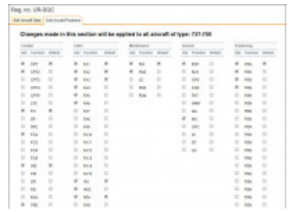
Editing aircraft positions

The tab "Edit Aircraft Positions" gives you a selection of crew positions available in the system. These are set per aircraft type, not a particular registration number, so if you add another aircraft of the same type, the positions will be copied over. These need to be defined in the fleet settings in order to be later available to be assigned to the crew members.