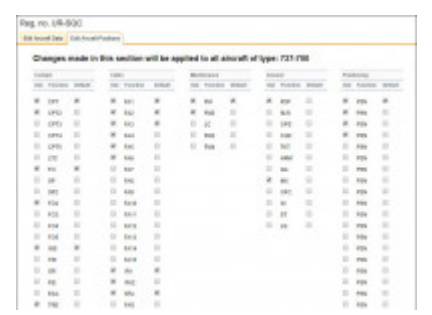
Editing aircraft positions

The tab "Edit Aircraft Positions" gives you a selection of crew positions available in the system. These are set per aircraft type, not a particular registration number, so if you add another aircraft of the same type, the positions will be copied over. These need to be defined in the fleet settings in order to be later available to be assigned to the crew members.