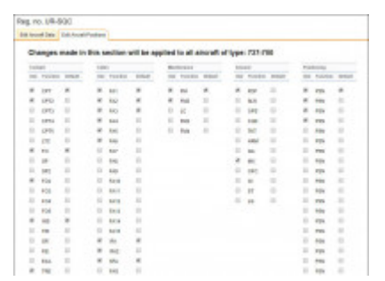
Editing aircraft positions

The tab "Edit Aircraft Positions" gives you a selection of crew positions available in the system. These are set per aircraft type, not a particular registration number, so if you add another aircraft of the same type, the positions will be copied over. These need to be defined in the fleet settings in order to be later available to be assigned to the crew members.