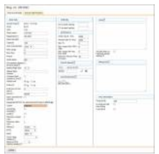
Aircraft data editing panel

To add a new aircraft, go to Settings > Fleet and click the link "Add new aircraft". If you type first letter or number of the aircraft type you want to add, Leon will show a suggestion in the drop-down list. You also need to insert aircraft short name and aircraft registration as these are mandatory fields. The other mandatory fields are: aircraft home base, colour (that will be used to represent the aircraft around the system – please avoid red and yellow as that will later prevent a clear view of various warnings) and a minimum number of the cabin & cockpit crew.