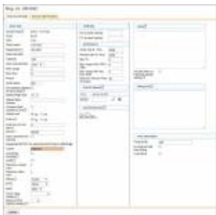
Aircraft data editing panel

To add a new aircraft, go to Settings > Fleet and click the link „Add new aircraft“. If you type first letter or number of the aircraft type you want to add, Leon will show a suggestion in the drop-down list. You also need to insert aircraft short name and aircraft registration as these are mandatory fields. The other mandatory fields are: aircraft home base, colour (that will be used to represent the aircraft around the system – please avoid red and yellow as that will later prevent a clear view of various warnings) and a minimum number of the cabin & cockpit crew.