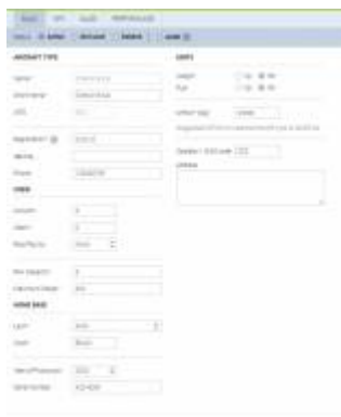
Aircraft data editing panel

To add a new aircraft, go to Settings > Fleet and click the link „New aircraft“. If you type first letter or number of the aircraft type you want to add in the field Name, Leon will show a suggestion in the drop-down list. It is important that you go through all the tabs and fill in the aircraft data as this section is a source of information for many functions in the system.