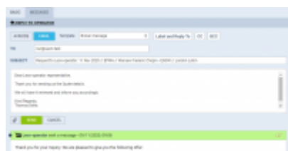
'Messages' tab in Subcharter

In this tab, it is possible to reply to the Broker in Avinode or directly to the Operator.