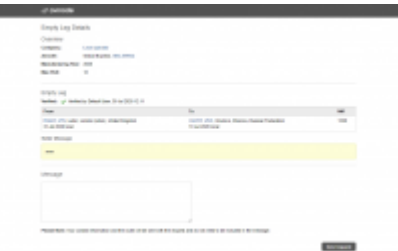
Request for empty leg in Avinode