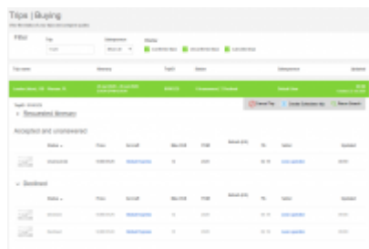
Rejected requests in Avinode

It is possible to reject requests directly from the list of requests.