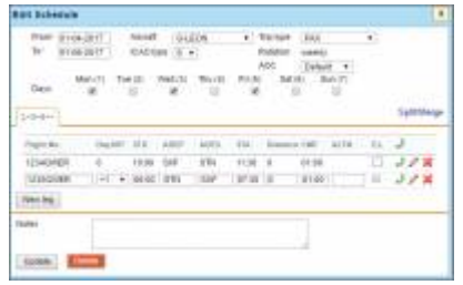
Commercial Order main screen

By clicking New schedule icon, a new pop-up window will show up. A period of time for the new order will be copied from 'Season' definition but it can be changed. Select an aircraft, a trip type, ICAO type and the days of flights (i.e. 1, 3, 5 for Monday, Wednesday and Friday). After adding flight number you can optionally select 'Day SHT' (Day shift), which means shifting your order for selected number of days forward. I.e. if you select +1 and the order is supposed to start from Monday (a box '1' is ticked), then the order will start from Tuesday. Selected STD/STA times and ADES/ADEP details will get automatically exported to the 'Flights List' page.