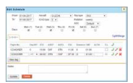
Commercial Order main screen

By clicking New schedule icon, a new pop-up window will show up. A period of time for the new order will be copied from 'Season' definition but it can be changed. Select an aircraft, a trip type, ICAO type and the days of flights (i.e. 1, 3, 5 for Monday, Wednesday and Friday). After adding flight number you can optionally select 'Day SHT' (Day shift), which means shifting your order for selected number of days forward. I.e. if you select +1 and the order is supposed to start from Monday (a box '1' is ticked), then the order will start from Tuesday. Selected STD/STA times and ADES/ADEP details will get automatically exported to the 'Flights List' page.