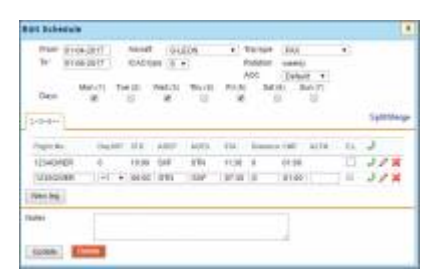
Commercial Order main screen

By clicking New schedule icon, a new pop-up window will show up. A period of time for the new order will be copied from 'Season' definition but it can be changed. Select an aircraft, a trip type, ICAO type and the days of flights (i.e. 1, 3, 5 for Monday, Wednesday and Friday). After adding flight number you can optionally select 'Day SHT' (Day shift), which means shifting your order for selected number of days forward. I.e. if you select +1 and the order is supposed to start from Monday (a box '1' is ticked), then the order will start from Tuesday. Selected STD/STA times and ADES/ADEP details will get automatically exported to the 'Flights List' page.