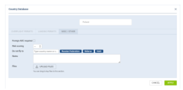
'Country Database' - 'MISC/OTHER' tab