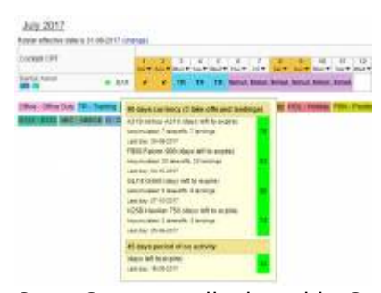
Crew Currency displayed in Crew Duties roster

Crew currency feature will work properly only when Journey Logs are being added to Leon and the field 'Pilot Flying' has been filled in with pilot/pilots codes. In case where FO did take off and CPT did landing (or vice versa), you should add crew codes in a field 'Pilot Flying' as FO/CPT or CPT/FO