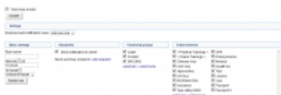
General view on Email notification

Leon sends email notifications about endorsements expiry date to selected people (Managers or OPS) as well as to endorsements owner (a particular crew member) according to defined time intervals.