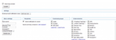
General view on Email notification

Leon sends email notifications about endorsements expiry date to selected people (Managers or OPS) as well as to endorsements owner (a particular crew member) according to defined time intervals.