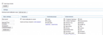
General view on Email notification

Leon sends email notifications about endorsements expiry date to selected people (Managers or OPS) as well as to endorsements owner (a particular crew member) according to defined time intervals.