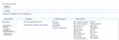
General view on Email notification

Leon sends email notifications about endorsements expiry date to selected people (Managers or OPS) as well as to endorsements owner (a particular crew member) according to defined time intervals.