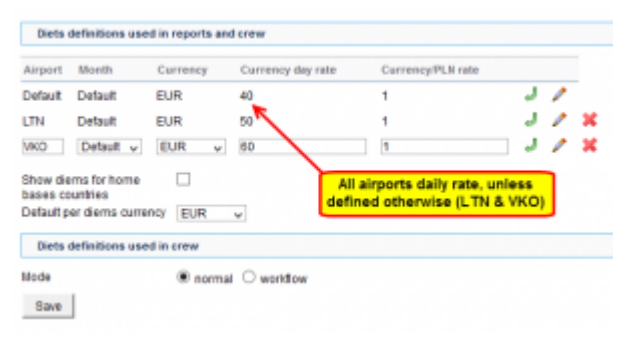
Per Diems - mode 'Normal'

In this mode you can see columns such as: