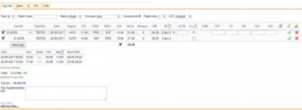
Flight edition main screen

Features of this section have been largely explained in New Flight part of this manual.