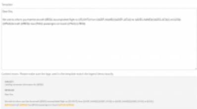
Example of Content error when creating conditional MVT Message