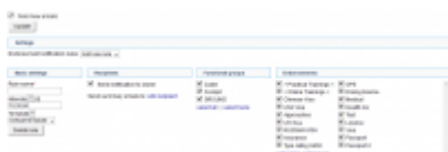
General view on Email notification