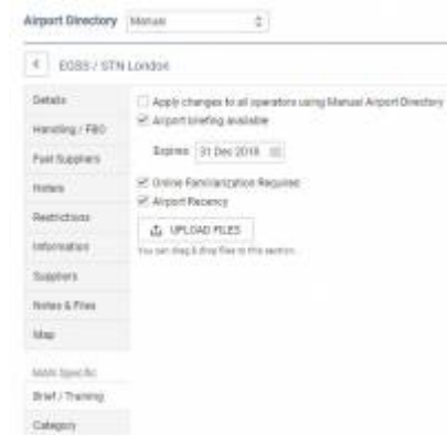
Airport Directory - adding online familiarization and airport recency

Some airports require pilots to familiarize themselves with important information regarding this airport before flying there - this is when the ' Airport brief ' document should be added to Leon to be available to pilots. The same applies to airport ' Airport Recency ' or Online Familiarization documents.