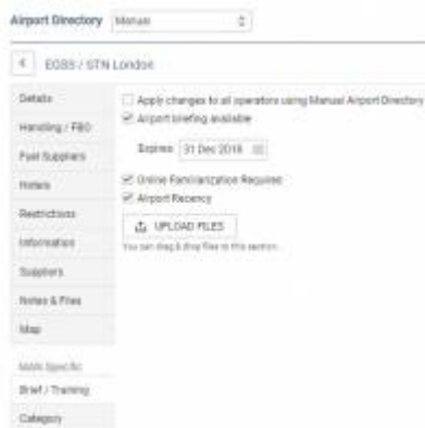
Airport Directory - adding online familiarization and airport recency

Some airports require pilots to familiarize themselves with important information regarding this airport before flying there - this is when the ' Airport brief ' document should be added to Leon to be available to pilots. The same applies to airport ' Airport Recency ' or Online Familiarization documents.