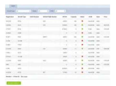
Fleet - the general view on the list of aircraft

Managing the fleet in Leon is easy and handy. This section allows you to sort all essential information about aircraft in many ways. You can either display all types of aircraft or just one, you can hide tails that are not being used or view only ACMI aircraft.