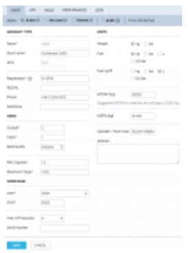
Aircraft edition - basic details

This page shows basic aircraft information and is split into a few sections, such as: