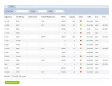
Fleet - the general view on the list of aircraft

Managing the fleet in Leon is easy and handy. This section allows you to sort all essential information about aircraft in many ways. You can either display all types of aircraft or just one, you can hide tails that are not being used or view only ACMI aircraft.