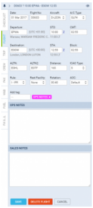
Tab FLIGHT - flight edition with additional options

This section gives you a quick overview of flight details as well as allows you to add other properties to the flight.