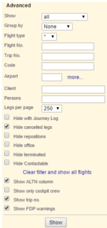
Advanced filtering options

When label 'Aircraft' or 'Advanced' is clicked, additional filter options are visible and you can use various filtering criteria. Most of options are self explanatory. Below are explained those which are not obvious: