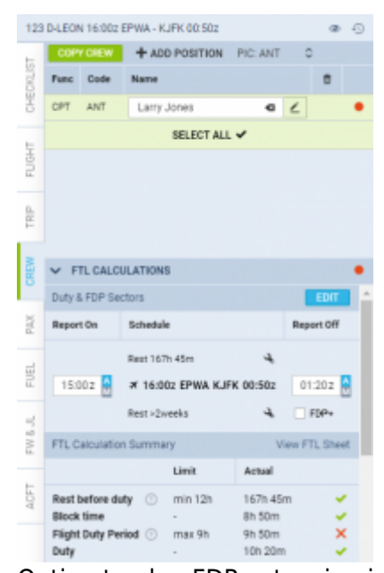
Option to plan FDP extension in CREW tab

It is possible to select an extension mode. In order to do that please contact support@leonsoftware.com