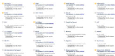
Fuel prices list

If you are a holder of fuel cards, such as WFS, Shell, JetEx, etc..., you can upload current fuel prices into Leon. All uploaded prices show in a section OPS, tab FUEL of the right-hand filter.