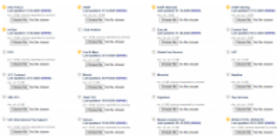
Fuel prices list

If you are a holder of fuel cards, such as WFS, Shell, JetEx, etc..., you can upload current fuel prices into Leon. All uploaded prices show in a section OPS, tab FUEL of the right-hand filter. You can also mark fuel supplier as favourite . This will highlight the supplier in the FUEL tab in the OPS section.