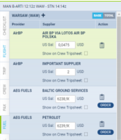
Fuel prices from the uploaded fuel file

Tab FUEL shows fuel data from uploaded files in section OPS > Fuel Prices. The section is split into 2 parts: ADEP fuel prices & ADES fuel prices.