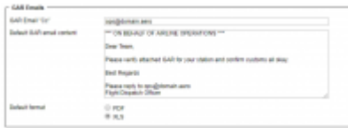
GAR Template settings

GAR emails configuration can be found in a section Settings > General Settings as a separate tab.