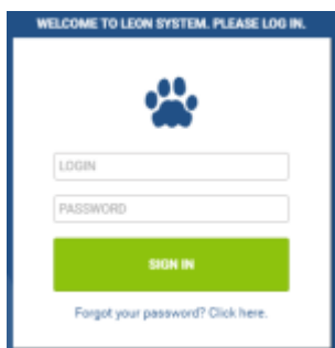
Password reminder option