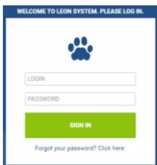
Password reminder option

In case when Leon user forgets the password, there is an option to reset it directly from the system.