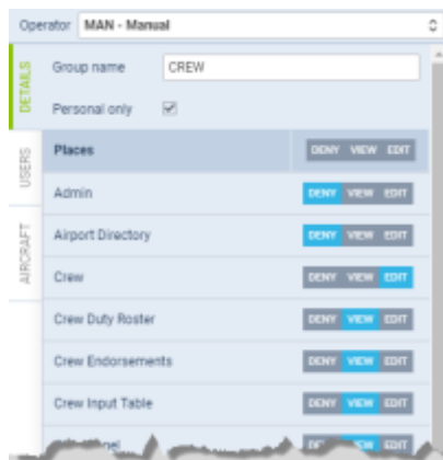
New Privileges filter

The filter in New Privileges panel contains of 3 tabs: