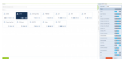
New Privileges - the general view

The general view of the New Privileges page shows groups with their names, aircraft assigned and number of users assigned to a particular group. If the group has the access level set up as Personal only , Leon shows SELF in top-left corner.