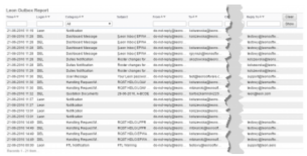
Leon Outbox report

Leon Outbox Report allows you to view details of any notifications that were sent from Leon. This is very helpful when a notification email did not arrive and you would like to check if it was actually sent.