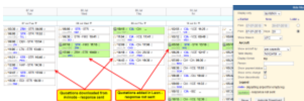
Calendar list of quotations downloaded from Avinode or added in Leon

All quotes are visible in Sales > Calendar screen - set your filter from 'trips' to 'quotation' to view them. Once you click the Avinode Download button, all the newly submitted quote-requests will appear in the system with a green background (see also chapter Quotations ).