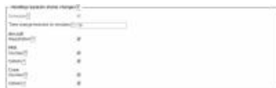
Handling requests status changes