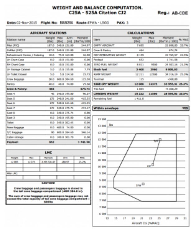
Weight & Balance - pdf file available in Leon

In Leon 3.0 Weight & Balance panel allows you to manually adjust details. You can edit particular fields and adjust values.