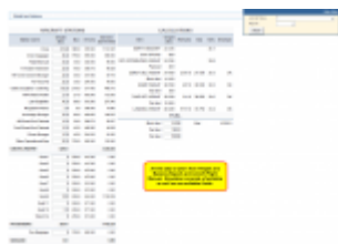
Weight and Balance simulation page

In order to set up Weight and Balance for an aircraft you need to contact support@leonsoftware.com and send Aircraft Flight Manual or Weight and Balance Report.