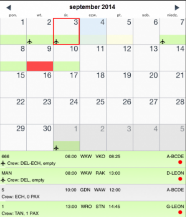
Viewing duty day on iPad

To view your duty, simply click on the square with the aircraft icon, or with the duty-type (D-duty, V-vacation, etc). Right below the calendar you will see details of the flight/flights to which you have been assigned: