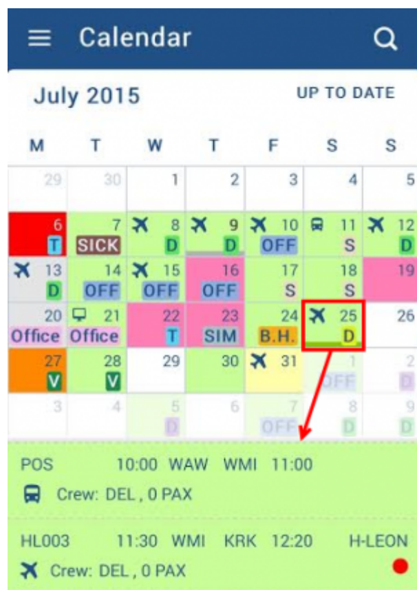
Duty page display

work (computer icon). Only one icon is displayed. If there are multiple activities, the most important one is displayed in the following order: flight, positioning, office work.