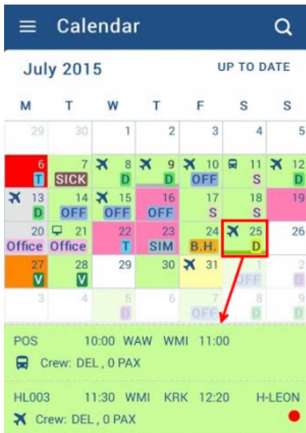
Duty page display

5 - main activity symbol - appears if the logged-in user is scheduled as a crew member for any flight on that day, according to the filter settings. The same applies to positioning (bus icon) or office work (computer icon). Only one icon is displayed. If there are multiple activities, the most important one is displayed in the following order: flight, positioning, office work.