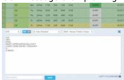
GCR example - flights on the following days