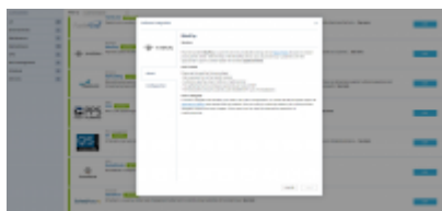
Integration with MIRAI in Leon

Payment system MiraiPay is a part of one-click private jet booking service 'Mirai Flights' focused on instant pricing to the clients. With the help of the MiraiPay service, you can provide your customers with the opportunity to pay for charter flights with several cryptocurrencies.