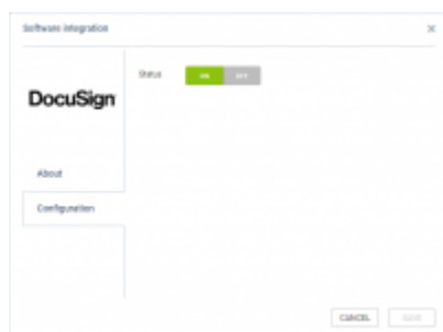
DocuSign integration panel

This integration is currently free of charge however it will change in the future. Leon will charge Clients for this integration and it is due to DocuSign charging policy for using their API. We will notify the Clients using this integration in advance.