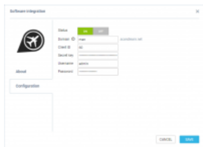
Scandlearn in the Add-ons panel

Scandlearn is the ultimate all-in-one crew training solution for companies, organisations and authorities, at any size, including the ones in the aviation industry.