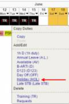
Accepting crew duty request