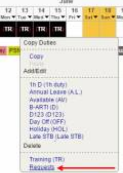
Rejecting crew duty request

Before this change, crew were able to make requests in the Duty Roster only for days without assigned duties.